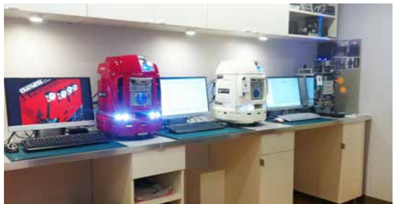
Robots at attention in the TIP command center