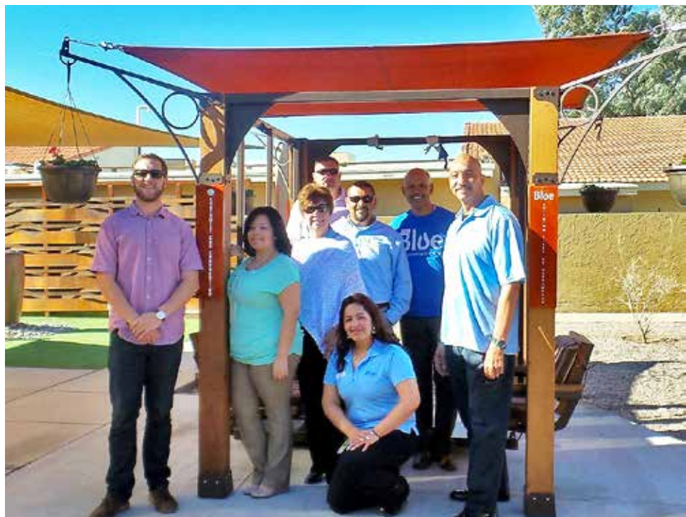
Southwest Gas Blue Crew volunteers

platform. Her caregiver safely secured the wheelchair, sat on the guest side, and gently pushed off the swing with her feet. The young lady smiled with delight and laughed as she moved both forwards and backwards with the swing. Everyone applauded and smiled. Each resident had a turn and expressed the same delightful laugh of surprise with big smiles. For all the volunteers, the fundraising, physical work, sweat, heat, and weeks of planning paid off with those smiles and laughter on Saturday.