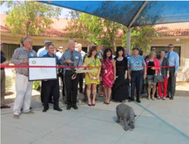
Rotarians, Phoenix Chamber members and Hacienda Staff

Phoenix Squaw Peak Rotary Club and Hacienda move forward on enabling garden project.