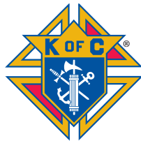
Bishop Granjon Council # 4339