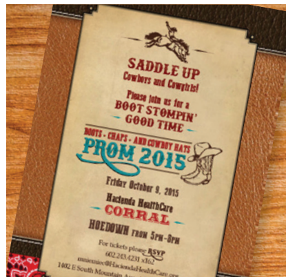
This year's Prom invitation