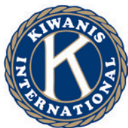
Valley of the Sun Kiwanis