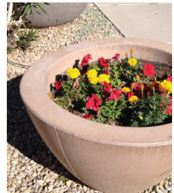
Hacienda's main entrance flower pots.