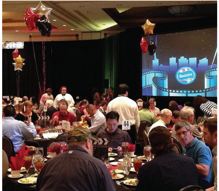
2015 SRP Employee Boosters Association Premier Donor Luncheon

Hacienda HealthCare is grateful to be a part of the SRP Boosters program whose contributions have helped us enrich the lives of over 2,550 clients/patients and their families every year.