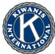
Valley of the Sun Kiwanis