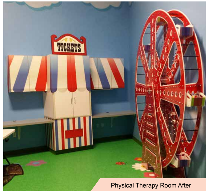
Physical Therapy Room After