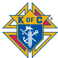
Bishop Granjon Council # 4339