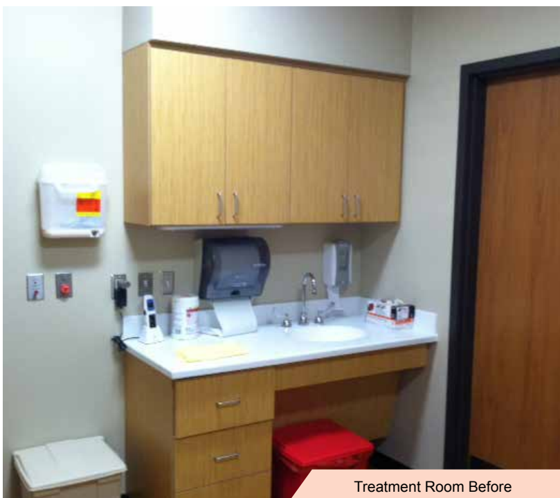
Treatment Room Before