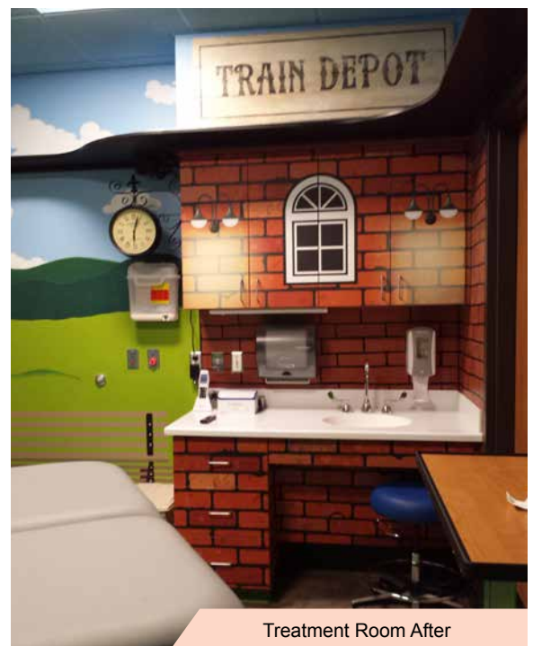
Treatment Room After