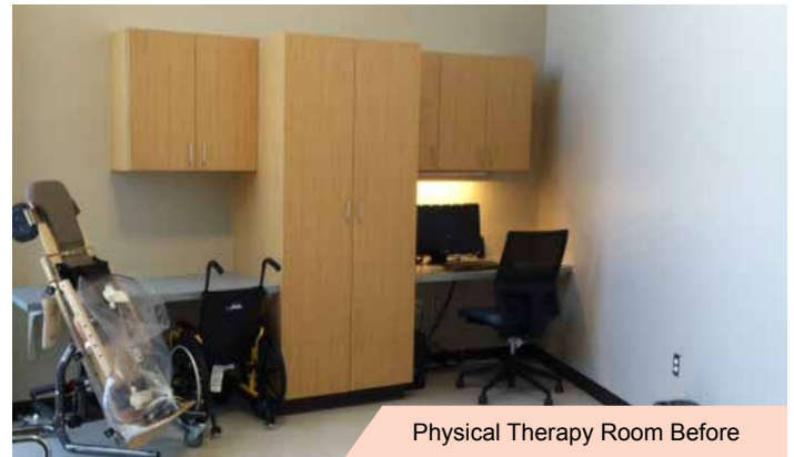
Physical Therapy Room Before