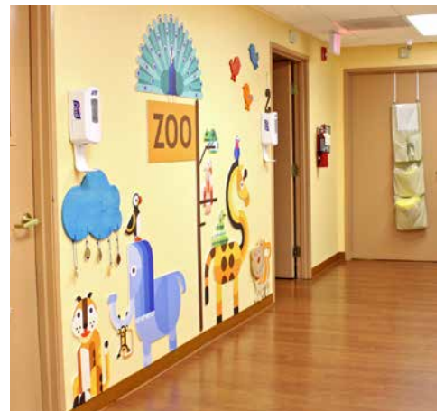
Top right photo: Treatment room at Hacienda Children's Hospital designed by Room For Joy. All other photos: The new interactive walls at Los Niños Hospital featuring a heat sensored art board (bottom left) and other motion games throughout the hospital.