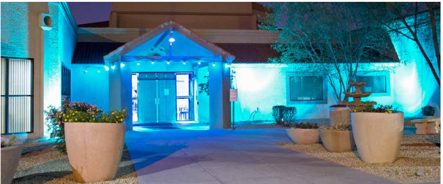
Top photo: Tom Burick and the TIP Team. Bottom photo: Hacienda HealthCare's Main Campus participated in the "Light It Up Blue" campaign by lighting up the front entrance.